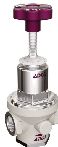
PS30SS 1/2" – DN 15

INSTALLATION: Horizontal installation. A "Y" strainer should be installed upstream of the valve. See IMI – Installation and maintenance instructions.